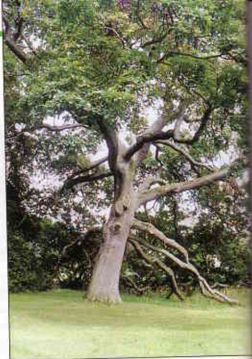
Like this ancient oak tree - the Province of Ireland, year in, year out, spreads new branches worldwide

the Irish Province, where each is proud of its own past achievements, its own way of doing the things that make the Province a Spiritan jurisdiction very much alive.