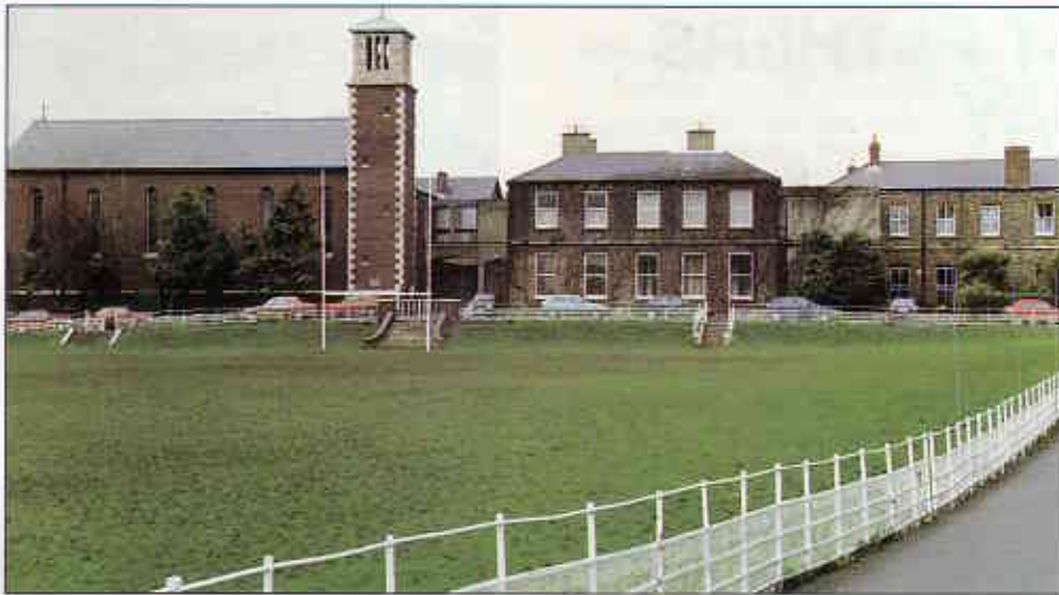
St Mary's College, Rathmines, founded by the Holy Ghost Fathers in 1890