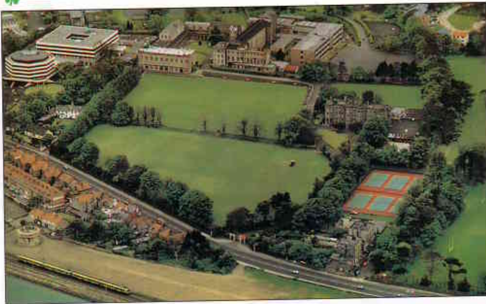
An aerial view of Blackrock College founded by the Holy Ghost Fathers in 1860