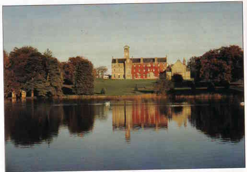
Rockwell College founded by the Holy Ghost Fathers in 1864

Long may they continue to do so, the generous young Irish men and women of Ireland who carry on their country's great missionary tradition of peregrinatio Christi - travelling the world for Christ and may the Spiritans of Ireland, hopefully, be always there among them in the 21st century! †