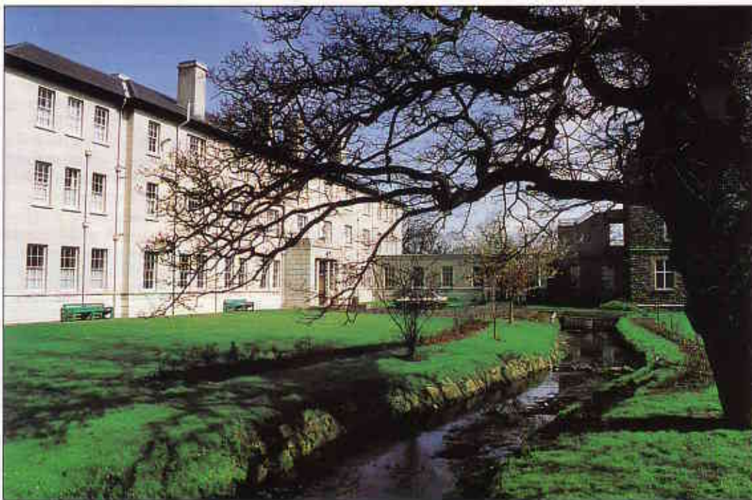
On the north bank of the Poddle river, stand the New White House Wing and Marian House

In fine, the fact that the Province of TransCanada, now an international family of Irish, English, Scottish, Italian, Trinidadian and Canadian-born members, has been able to achieve so much in such a short time - forty years - is due in great measure, to the good graces and wonderful support that the Province of Ireland has given it. †