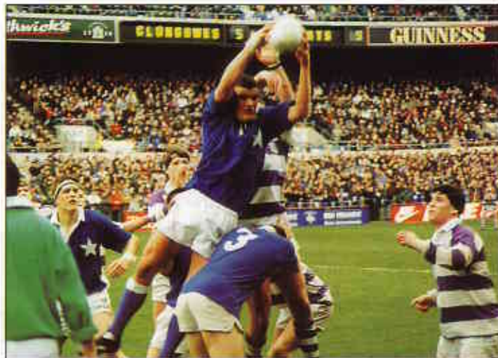
How St Mary's won the Cup before 20,000 spectators

Anyone privileged to attend the final SCT replay and victory celebrations afterwards will know why. This year, thanks to the indomitable spirit of the old