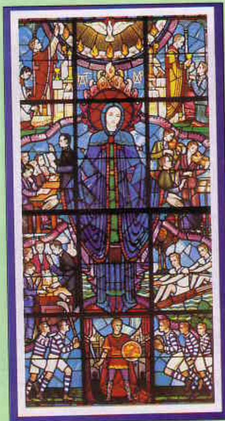
Irish Spiritan Ideals in Education (stained-glass window at Rockwell College) Our Lady, as Mother, with arms outstretched protectingly over all the activities of Spiritan schools

Many of the great patriots and churchmen who were to do so much to make Ireland a nation once again and complete the Catholic Church's emancipation from crippling Penal Laws, were educated in Spiritan schools e.g. Eamon de Valera, President of Ireland.