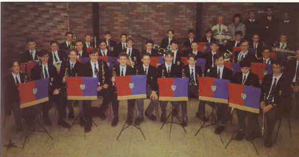
Templeogue College Band at practice