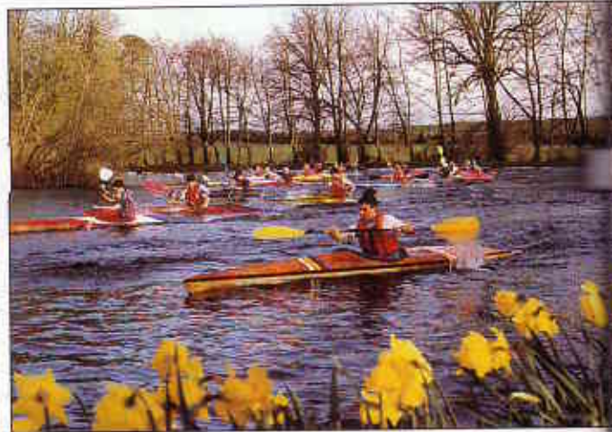
Rockwell Lake - a kayak spring training session

However, with its 23-acre lake, it also excels in water-sports. Once renowned for its rowing, it now is best known for its Canoe Club. Last year, Rockwell won the prestigious National Leander Liffey Descent (4-5 miles) for the 16th successive year. In 1993, sixty-one members of the club participated in national