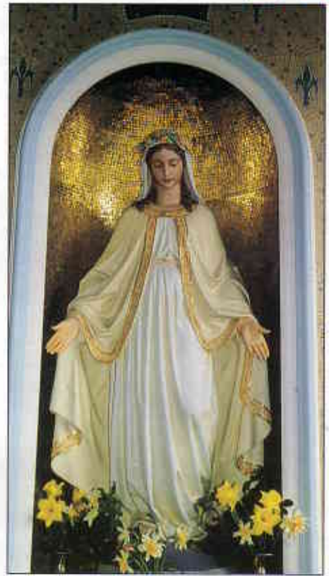
Devotion to Mary, an Irish and Spiritan tradition