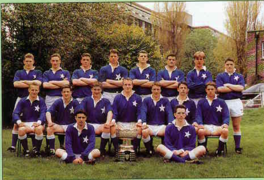
St Mary's Senior Rugby team, Leinster Champions 1994