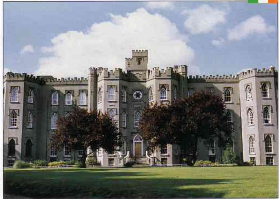
Blackrock Castle today - It was to be the second-chance starting place for the Spiritans in Ireland.

At first sight, the sudden expulsion of 300 priests might have seemed a fatal blow to this young Church but not to Nigeria.