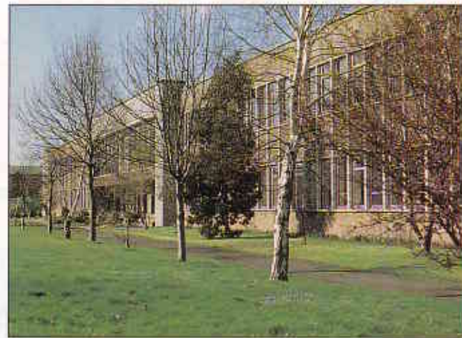
Templeogue College founded by the Holy Ghost Fathers in 1966