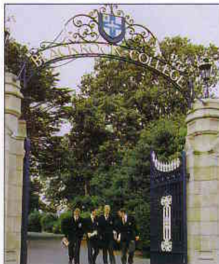
'Rock' Seniors discuss the day's happenings

Nor are the fine arts forgotten. Once famous for its annual Gilbert and Sullivan operas, it now presents musicals like Jesus Christ Superstar and Godspell. But this interest in classical music is not all. 'Rock has no less than 20 rock-bands and 4 of them make the stage at Leman Concert in the National Concert Hall, the annual 'Rock orchestral and choral extravaganza in which 400 students of the college display their talents.