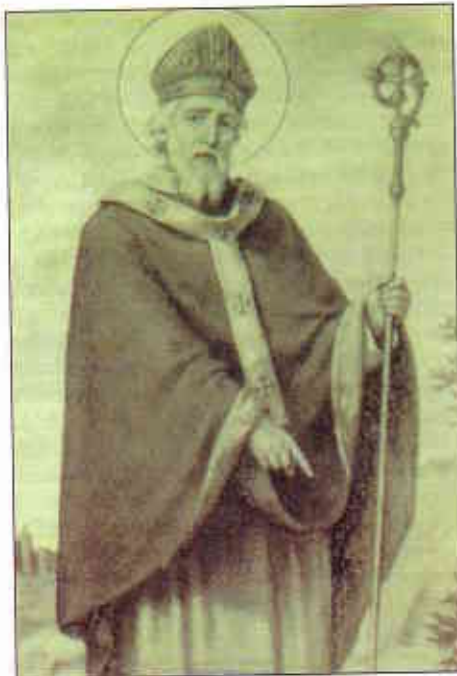
St Patrick's Day, March 17, a National Holiday celebrated by the Irish everywhere